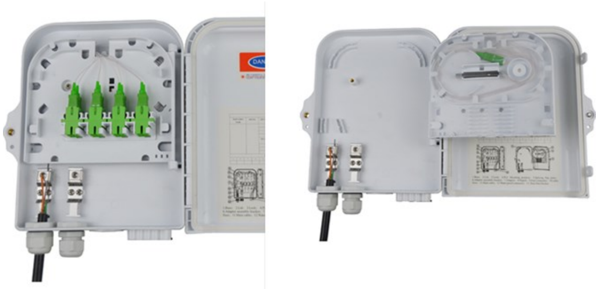
2 Input Ports