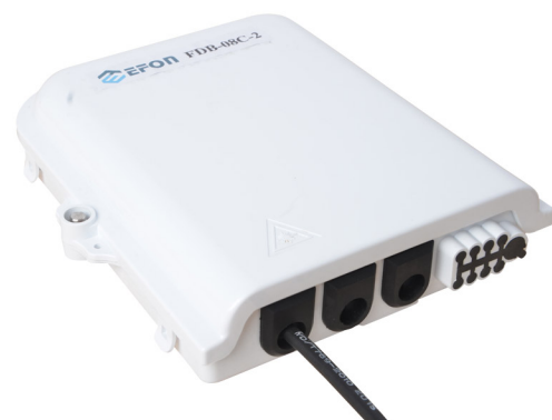
3 Input Ports