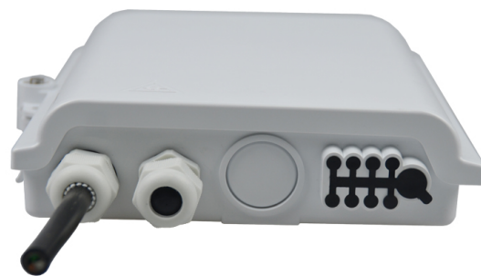
2 Input Ports